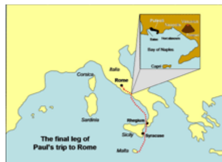
Puteoli and the Bay of Naples

"After three months we set sail in a ship that had wintered in the island, a ship of Alexandria, with the twin gods as a figurehead. Putting in at Syracuse, we stayed there for three days. And from there we made a circuit and arrived at Rhegium. And after one day a south wind sprang up, and on the second day we came to Puteoli. There we found brothers and were invited to stay with them for seven days. And so we came to Rome" (Acts 28:11-14).