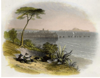
The view of Vesuvius from the Puteoli mole, W.H. Bartlett, 1856

The entire Bay of Naples is an active geologic area, most notably evidenced by the cataclysmic eruption of Mount Vesuvius in 79 A.D., when the towns of Herculaneum and Pompeii were completely destroyed and terrified residents of other nearby towns endured swaying buildings and dodged falling pumice stone for hours. While Puteoli was largely unaffected, its residents would have witnessed the event, particularly in the illuminated night sky. Just north of Puteoli, the Phlegraean (Greek for "burning") Fields featured numerous craters emitting sulfurous fumes and producing copious mineral waters. These healthful waters were piped into Puteoli, where Romans could enjoy baths at the Temple of Neptune's thermal facilities.