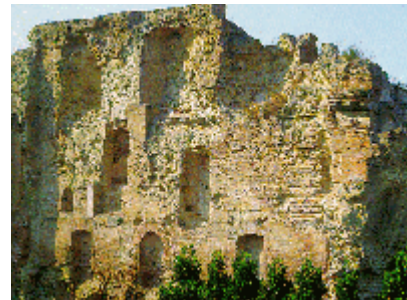
Remains of the Temple of Neptune

As a port city, Puteoli itself may not have been the most impressive city in the area, but its status as a port also made it a shopping mecca for consumers seeking mosaics, pottery, and perfume from the east. One of Puteoli's primary exports was "puzzuoli earth," a particularly strong form of cement combining volcanic ash with mud.