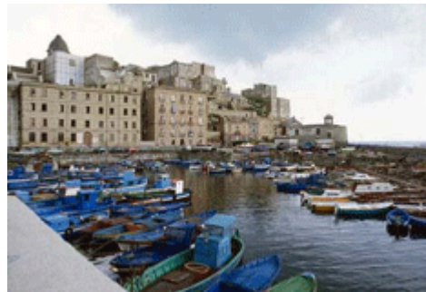
The waterfront of modern Pozzuoli (Puteoli)

Puteoli suffered steady decline shortly after Paul's time, having been upstaged by an upgraded port in Ostia. Much of the ancient city was only recently found and some lies under the waters of the bay. Today, Pozzuoli may be best known among Italians as the birthplace of the archetypal cinema sex symbol of the 50's and 60's, Sophia Loren.