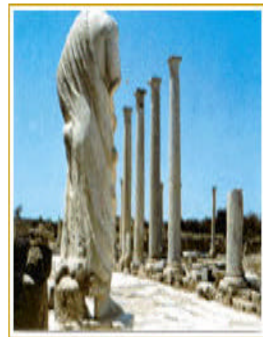
Ruins in ancient Salamis

The New Testament is silent about Barnabas' activities after his separation from Paul, so the rest of the Acts of Barnabas seeks to fill that gap. He and Mark crisscross the island nation, renewing acquaintances with believers and making many new converts. At one point, Mark reports a rather unapostolic reaction by Barnabas to a co-ed nude race, causing injury and even death to many of the participants. Finally, they end up in Salamis, on the eastern end of Cyprus, where Barnabas enters a synagogue where he reads from "the Gospel which he had received from Matthew." This so enraged the Jews, according to the author, that they "took Barnabas by night, and bound him with a rope by the neck...and having gone out of the city...they burned him with fire, so that even his bones became dust."