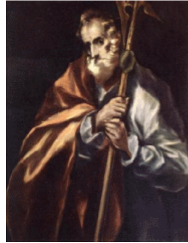
The Apostle St Thaddeus (Jude), El Greco, 1610-14 Click for a larger image

This is a very short work supposedly written about Thaddeus, one of the twelve disciples and an apostle, although there is some confusion about the identity of this New Testament figure. The name appears only twice in the New Testament: at Matthew 10:3 and Mark 3:18, where he is listed as the tenth of Jesus' disciples. In his list of the Twelve, Luke omits the name Thaddeus and mentions Judas, son of James, eleventh. Since all other names from Luke's list (Luke 6:16 and again at Acts 1:13) match up with those of Matthew and Mark, Thaddeus and Judas are clearly the same person. He is mentioned in John's Gospel only as "Judas (not Iscariot)" at 14:22. To confound things a bit more, the Acts of Thaddeus , claim this name was also known as "Lebbaeus." Many ancients had multiple names, and it would certainly not be surprising that him to have assumed a name other than Judas after the crucifixion.