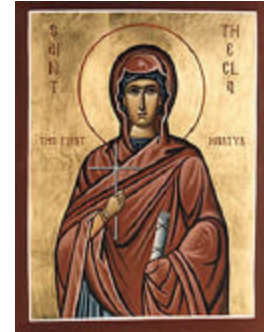
Byzantium icon of Thecla Click for a larger image

Paul and Thecla purports to occur during Paul's first missionary journey (AD 48-49) in Iconium, although the narrative conflicts with Luke's account. As Paul teaches in Iconium, Thecla, a beautiful virgin, accepts his decidedly ascetic message. As a consequence, she faces two sentences and is miraculously delivered from both. Sentenced to die by fire in Iconium because she rejects her impending marriage, she is condemned to fire, but a sudden violent storm quenches the flames, and she is released. Later, traveling with Paul to Pisidian Antioch, she catches the eye of a local official, who tries to force himself on her. When Thecla fights off his advances, she is sentenced to die in the arena fighting wild beasts. A lioness protects her from both a bear and a male lion, giving up her own life in killing the latter.