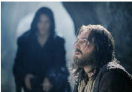
Mel Gibson's Passion of Christ, 2004

The consequences of their self-interest continued through the centuries as human beings displayed a remarkable tendency to choose self over God. Cain murdered Abel out of jealousy. Jacob coveted Esau's birthright. Joseph's brothers sold him into slavery. David sent Uriah to his death because he wanted Bathsheba. God gave Israel the Law to shine His light on sin, but Israel continued to choose self more often than not.